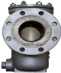
CAST BASKET FLANGED STRAINER