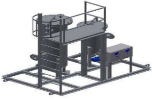
FUEL GAS CONDITIONING SYSTEM