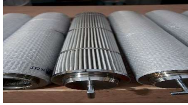
COALESCER FILTER SEPERATORS