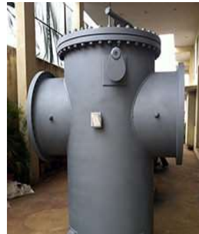
FABRICATED BASKET FLANGED STRAINER