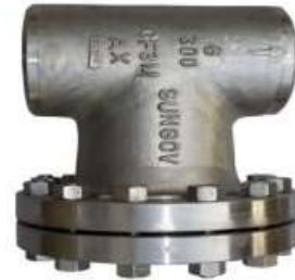
CAST FLANGED STRAINER