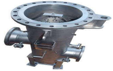
MULTI-CARRIAGE GAS FILTER